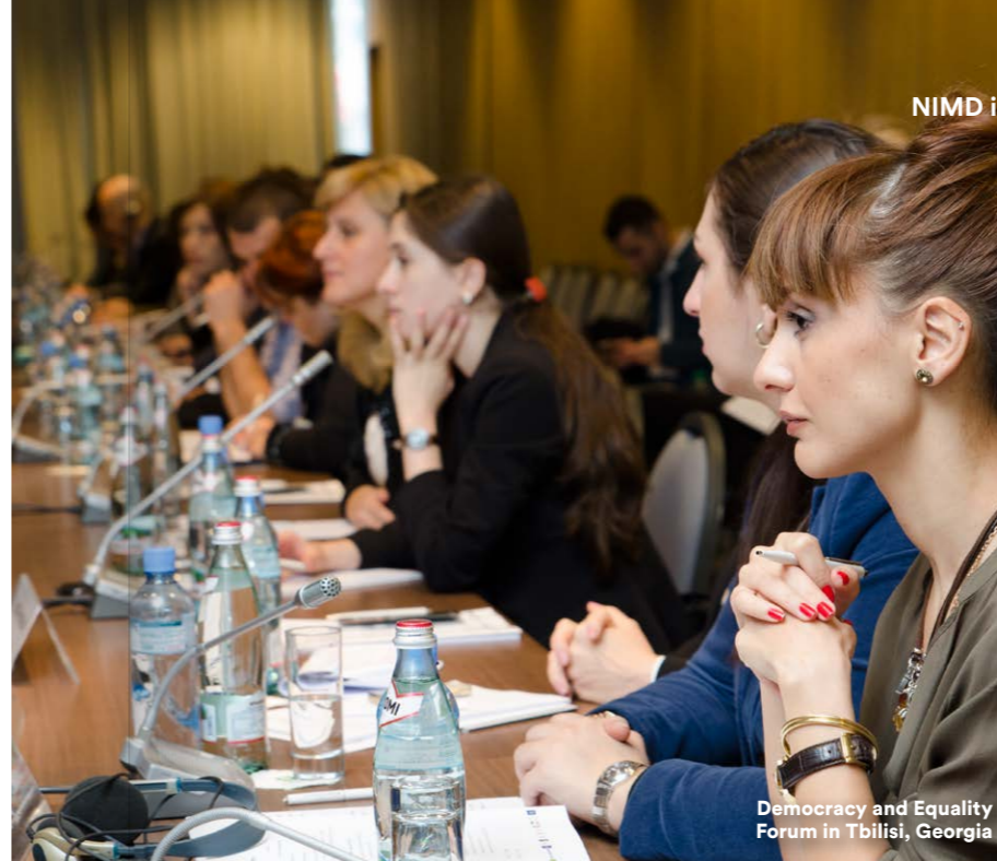
NIMD in 2015

Through the programme we assess the rules and regulations of the participating political parties and provide them with gender assessment reports. They can use these reports to develop plans to change their rules and practices and increase the level of participation of women. We also train and mentor aspiring female politicians for future political positions.