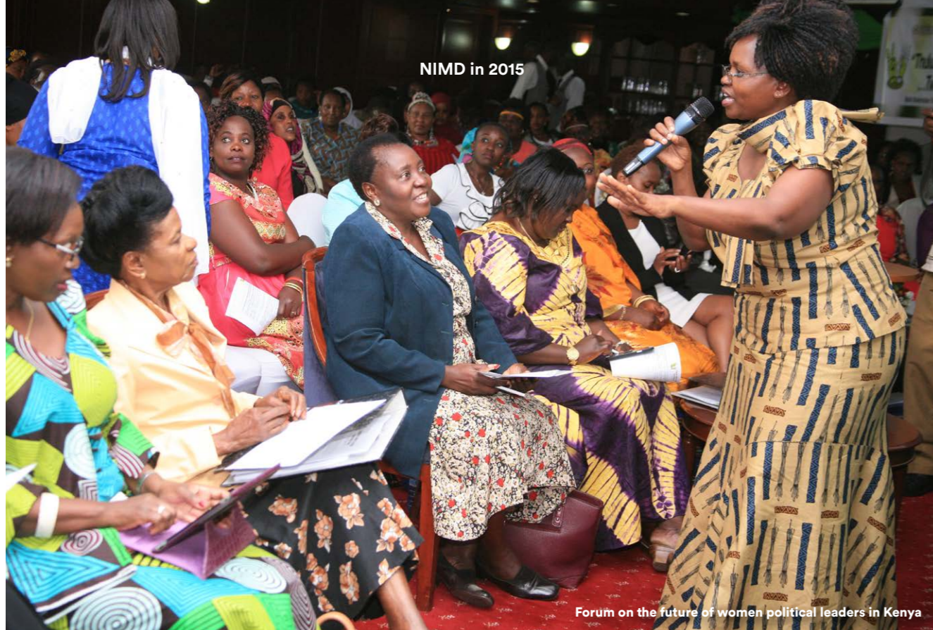
NIMD in 2015