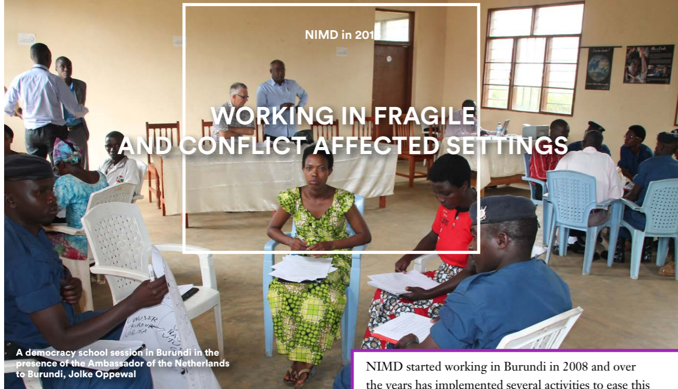
A democracy school session in Burundi in the presence of the Ambassador of the Netherlands to Burundi, Jolke Oppewal

After a country has been through a period of conflict or an authoritarian regime, the government's capacity to govern becomes extremely weak. These countries struggling to leave behind their legacy of violence and social upheaval are a cause for concern on the international policy agenda. And the need to develop capable and democratic political parties in these settings is a pressing one.