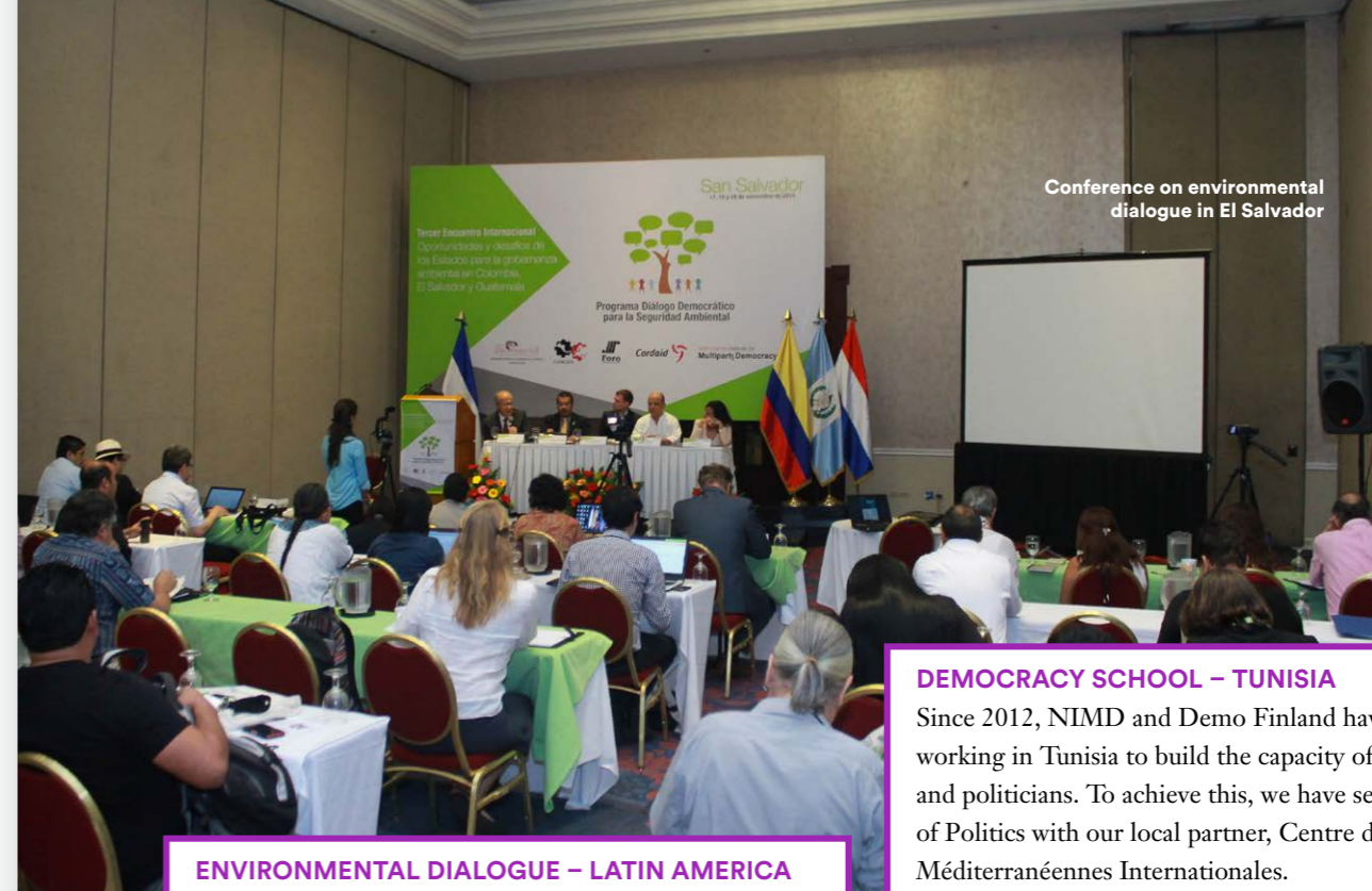
Conference on environmental dialogue in El Salvador

Apart from democracy schools we also connect ordinary people to the government through thematic programmes like the Environmental Dialogue platform in Latin America.