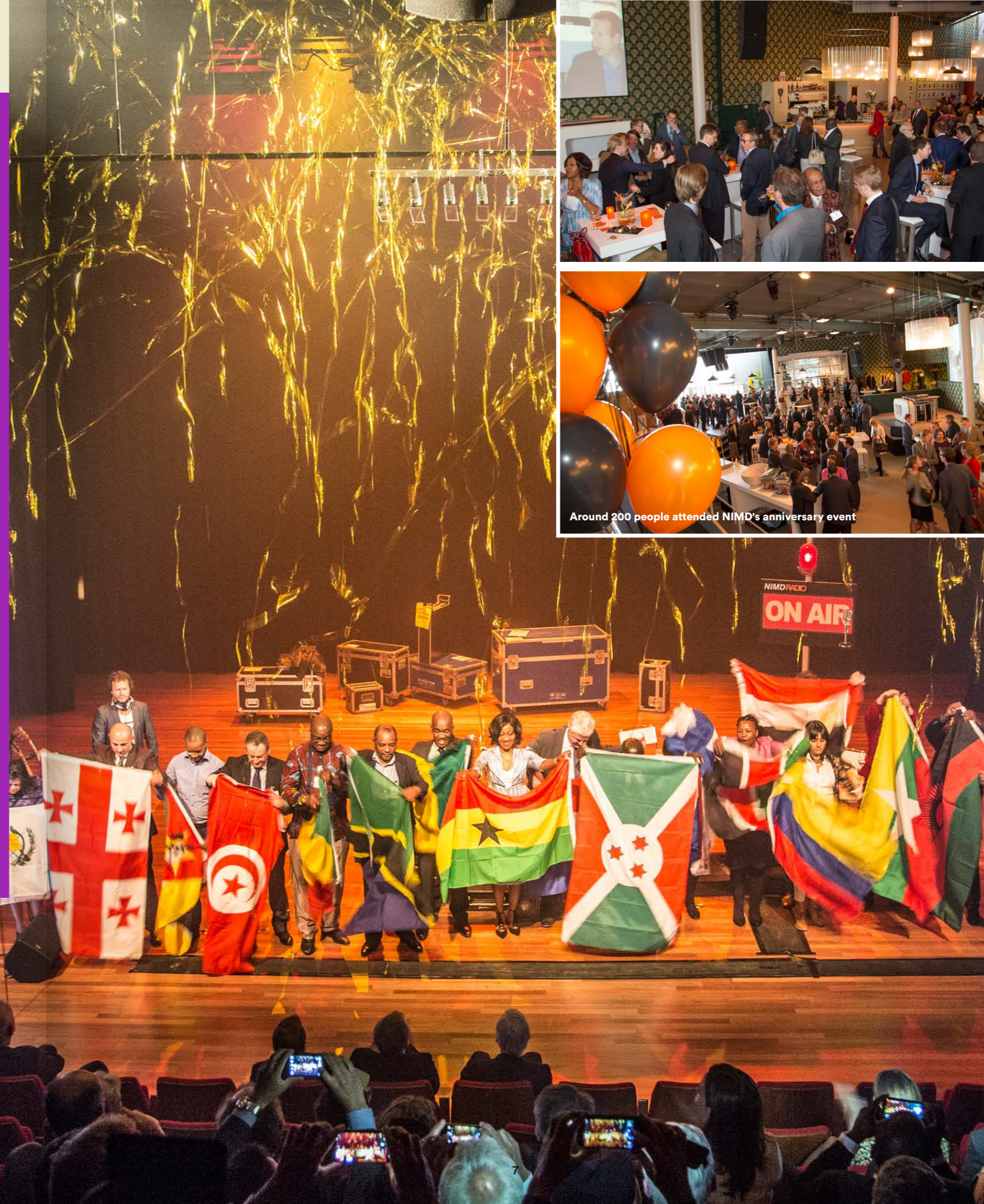
Around 200 people attended NIMD's anniversary event