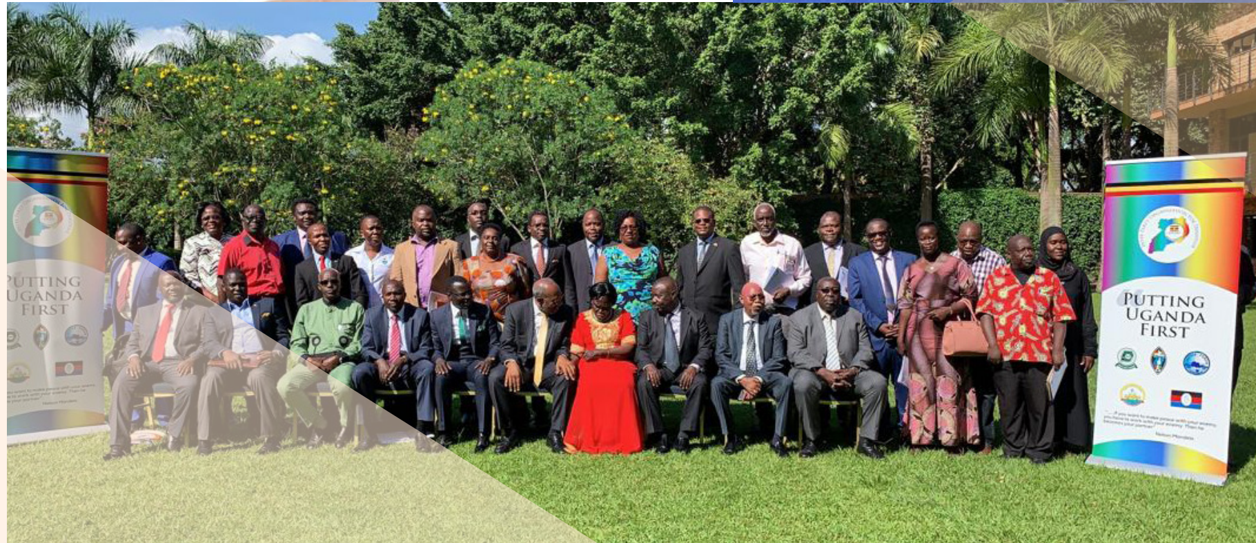
Secretaries General from all five of > Uganda's parliamentary parties, along with the Attorney General and several other senior government ministers, meeting in Kampala in 2019.