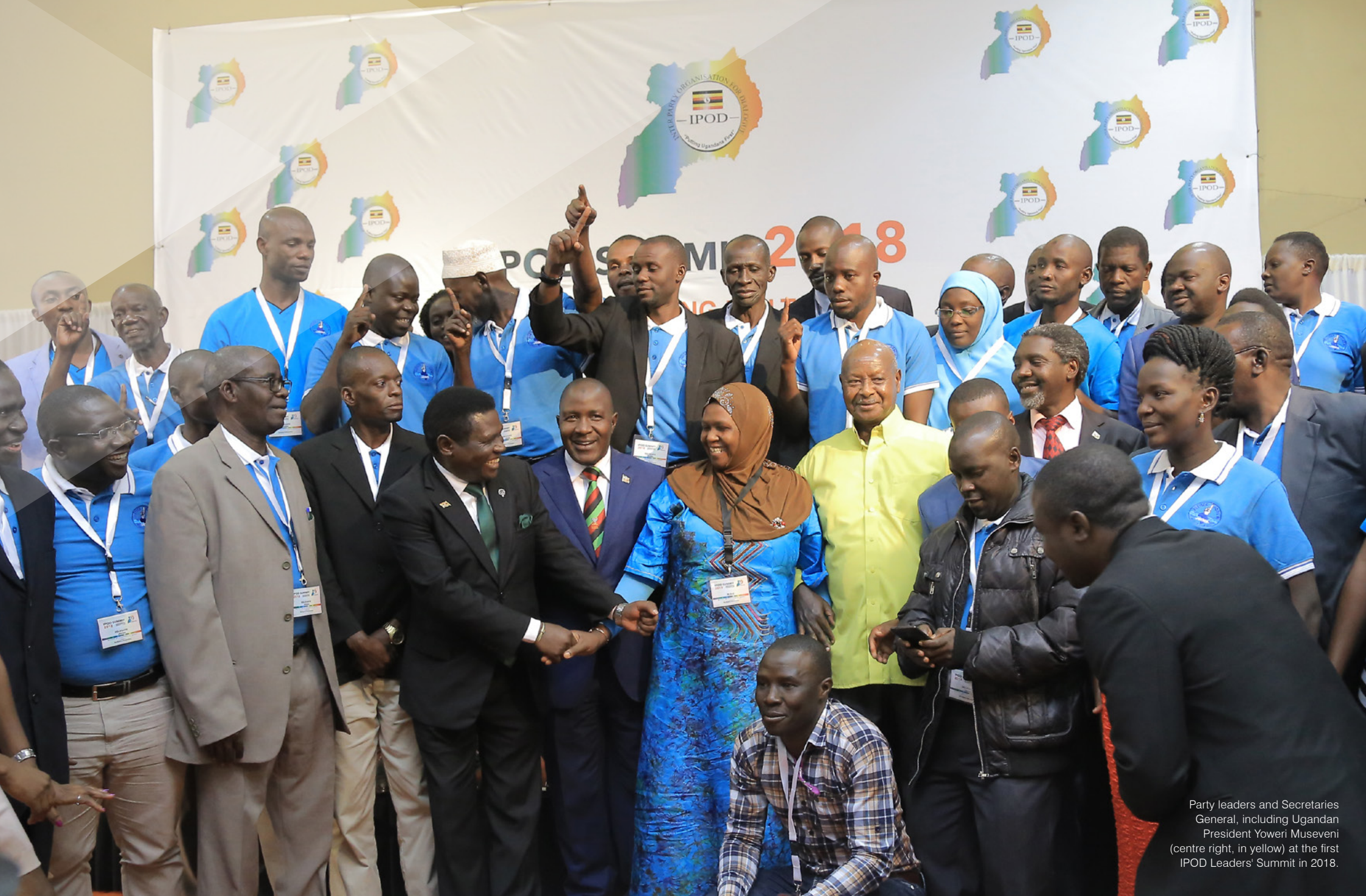
Party leaders and Secretaries General, including Ugandan President Yoweri Museveni (centre right, in yellow) at the first IPOD Leaders' Summit in 2018.