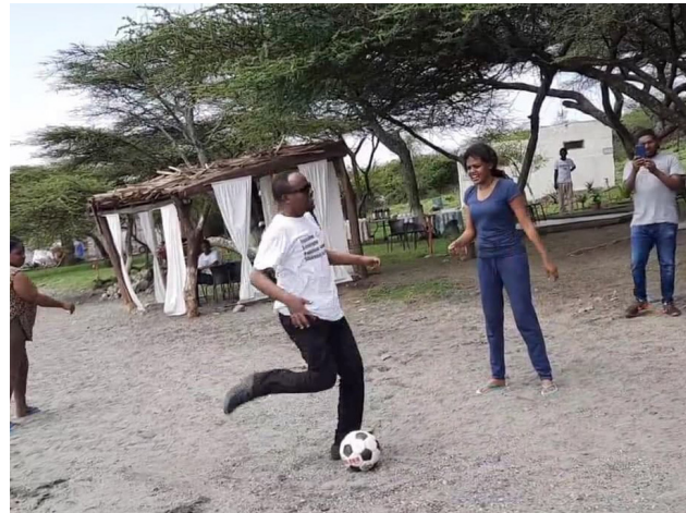
EDAC strongly focuses on the inclusion of women and people with disabilities. In the picture, our visually impaired EDAC trainee is playing football with his fellow colleagues.

at the table. EDAC has shown to be a vital capacity building mechanism to empower these underrepresented groups of young and promising individuals within their respective political parties.