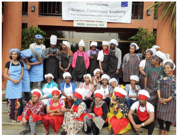
EDAC Training Round 2