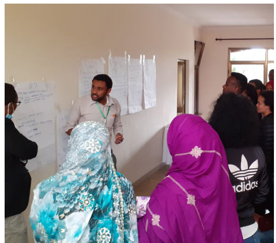
The trainees presenting their ideas and learning from each other's perspectives.

influence within their party (as can be seen in the figure on the right). EDAC is constantly consulting with political parties and relevant political youth movements to have them engaged, and ensure that the EDAC training is of utmost relevance and aligned to their knowledge and skills needs. Section 6 consists of the list of political parties and political youth movements that have sent their members to join the EDAC trainings.