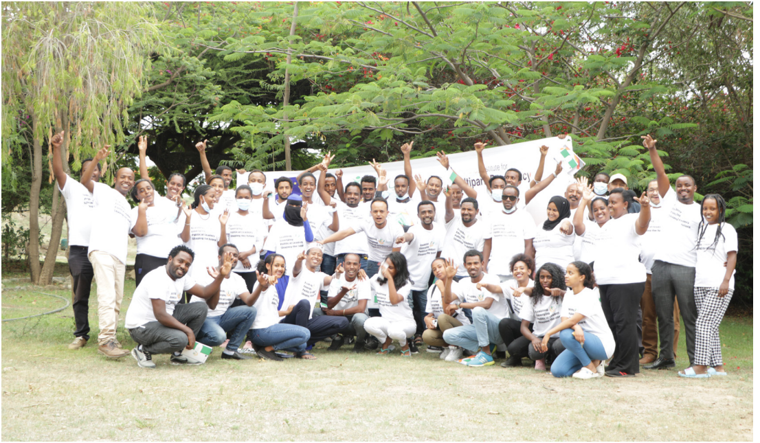
EDAC Training Round 3