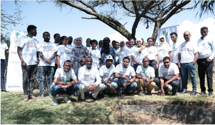
EDAC Training Round 1