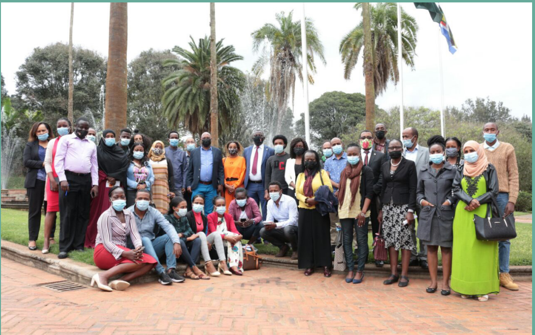
The upper photos show EDAC alumni visiting the KANU Headquarters and exchanging experiences as youth politicians in Ethiopia during the Youth in Politics Seminar. The photo under is a group photo taken together with Kenyan youth politicians.